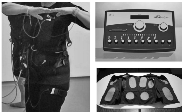
Figure 2. Whole-body electromyostimulation equipment.