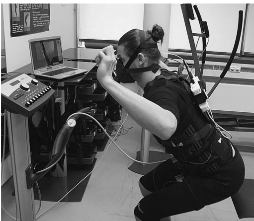
Figure 2. Shoulder press combined with the squat exercise with whole-body electromyostimulation equipment during the resistance protocol. All the exercises were performed in a dynamic mode.

Large methodological differences become apparent, which prevents a meaningful comparison of our data with studies using local EMS approaches (2,5,8,24). This especially refers to the local application with small electrodes, the immobilization of the resting muscle group (by fixation of the limb), the application of low current intensity (e.g., 25% of the MVC), and the choice of different endpoints (e.g., energy-rich